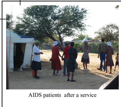
AIDS patients after a service

The first person who came to the tent for counselling was an elderly woman with heart problems. She had started with a medical doctor and thereafter consulted her church where she was given some blessed ropes to tie around her body and arms. Nothing worked. She was